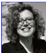
Director of Associate Membership

This promises to be an informative, eye-opening meeting. CEU Eligible