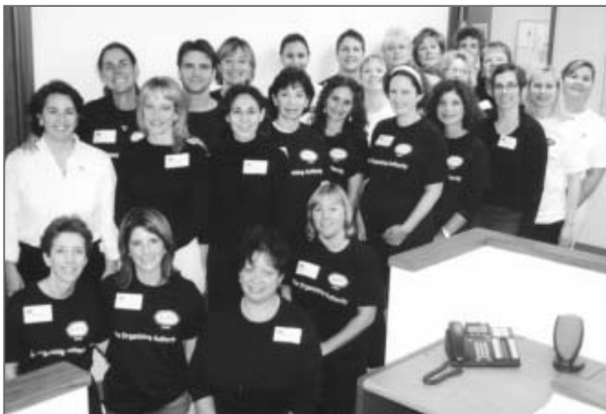
NAPO-LA's team of organizers at Habitat for Humanity-Los Angeles.