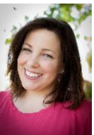
Director of Membership

Prepare to get your glam on and celebrate the successes of the past year in professional organizing!