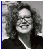
Director of Associate Membership

This promises to be an informative, eye-opening meeting. CEU Eligible